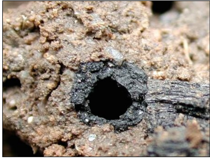
Fig Figure 4: Effect of Biochar + Compost on Corn Shoots & Roots

AC and biochar are very similar chemically, physically, yet different enough in physical properties and mode of action to need extra scrutiny of biochar before standards and regulations can clearly classify and authorize its use. Already, we have learned biochar works best if properly processed and prepared.