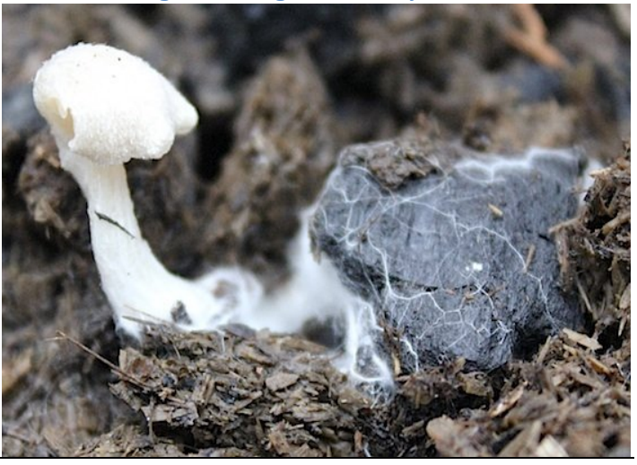
Figure 5: Fungus-Biochar Symbosis

carbon-smart tools for Midwest agriculture