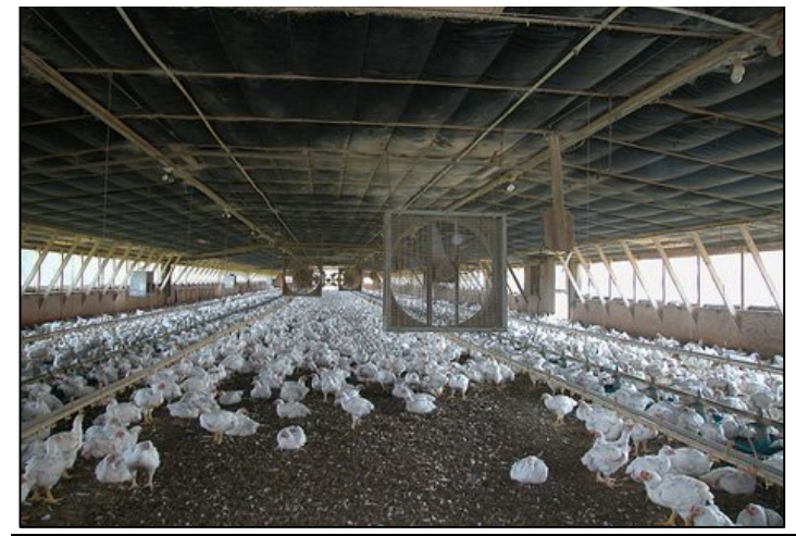
Figure 2: High population density in a poultry barn

and ammonia (NH4+) is all three. Activated carbon's effectiveness for odor control is wellknown, and preferred in air purifiers. So, a farmer's first small step is to blend 5 to 20%